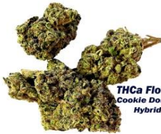
THCa Flower Cookie Dough Hybrid