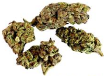
THCa Flower Oreo Hybrid